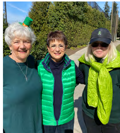
“Golfers in Green” this St. Patrick's Day!