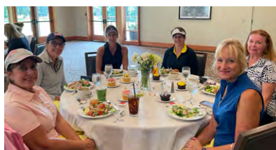
(both right) 9-Hole Driving Miss Daisy!