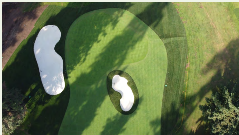
(left) Aerial shot of the newly renovated hole 2. The new bentgrass approach will be mowed tighter than the fairways. Once this new turf matures, there will be more definition between the approach and the green.