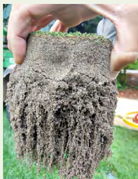
(above) Excellent root depth and density on the new east practice green. This green was seeded with Pure Distinction Bentgrass on May 13.

The golf course improvement project is moving along at a good pace, with the new holes on 1-3 are now open for play and the new East Putting Green open as well! Currently holes 4-6 are closed for renovation work.